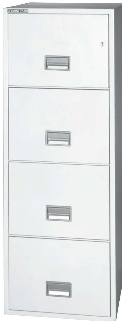
4LFD-2500: Four Drawer Vertical Letter size file. Outside Dimensions: 53 5 / 8 "H x 16 5 / 8 "W x 25"D Inside Drawer Dimensions: 10 1 / 4 "H x 12 1 / 8 "W x 20"D Approximate Shipping Weight: 320 lbs.

Schwab's Insulite™ insulation is the most efficient on the market today. Thicker insulation doesn't always mean better insulation. Insulite™ allows all Schwab files to offer features like thinner walls, lighter weight and recessed handles without compromising fire protection. This enables the Schwab design to maintain a look that is aesthetically pleasing without sacrificing its protective ability.